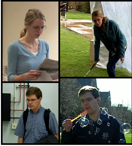
Fig. 1. Clips of two people sampled from four PaSC handheld videos: files 06599d91.mp4, 06599d451.mp4, 05450d1359.mp4 and 05450d1759.mp4.

covariates are reported for each participant. The covariates include properties of the faces such as size, the locations and sensors used to acquire videos, and properties of the subjects such as gender and race. The dominate factor influencing performance is the combination of locations, actions and sensors, indicating verification rates more than double when going from the most to the least challenging environments.