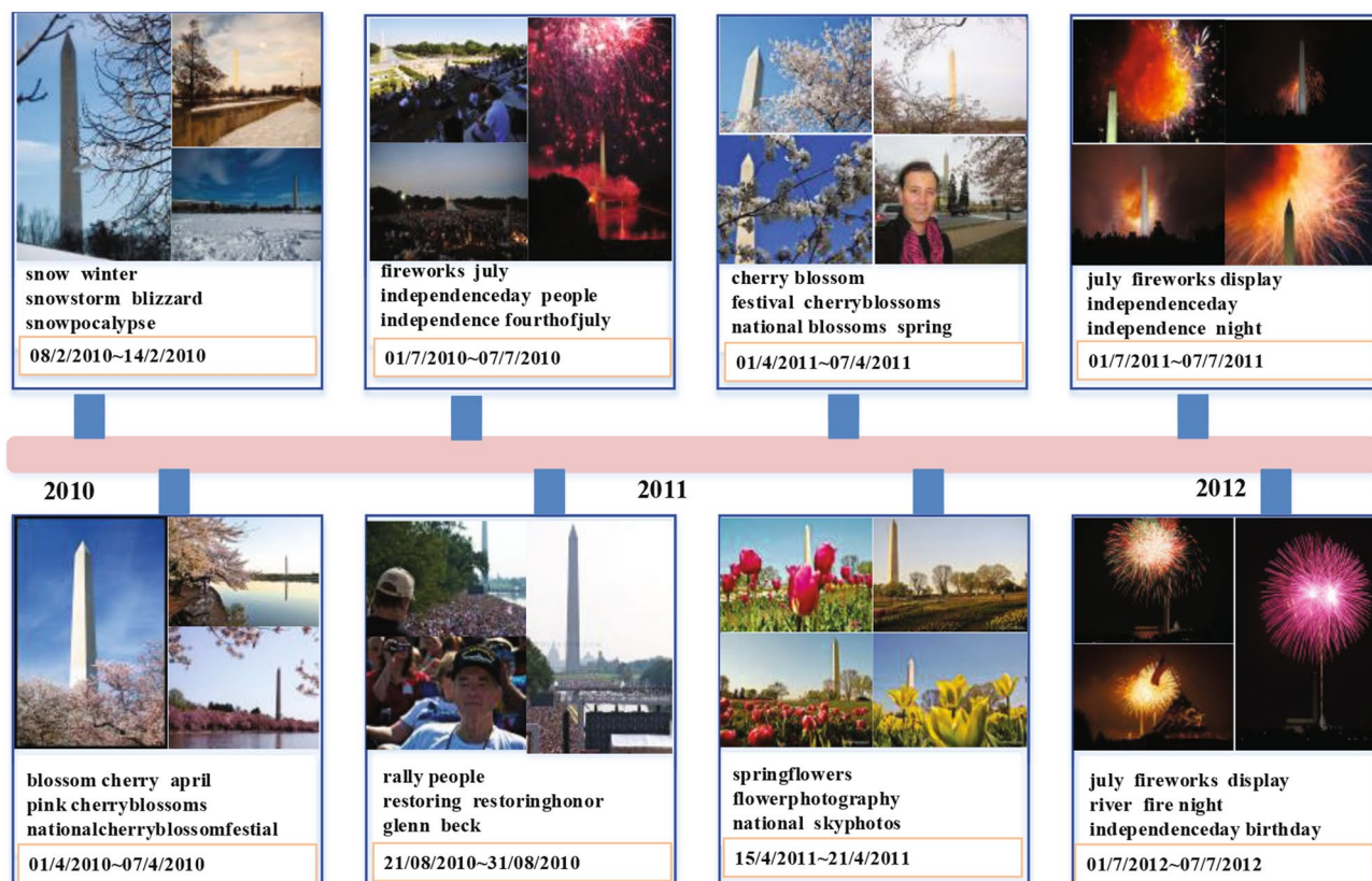
Fig. 4 The timeline of Washington memorial