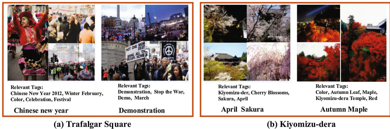
Fig. 1 An illustration of temporal themes from Flickr

landmarks, such as transportation and accommodation. The local theme implies one specific theme only existing at a particular landmark, such as their notable appearances and styles. The probabilistic theme models [5, 14] and their online versions [9, 12] have been successfully applied to discover themes from documents for text mining. However, compared with the existing methods, our task faces the following two challenges: