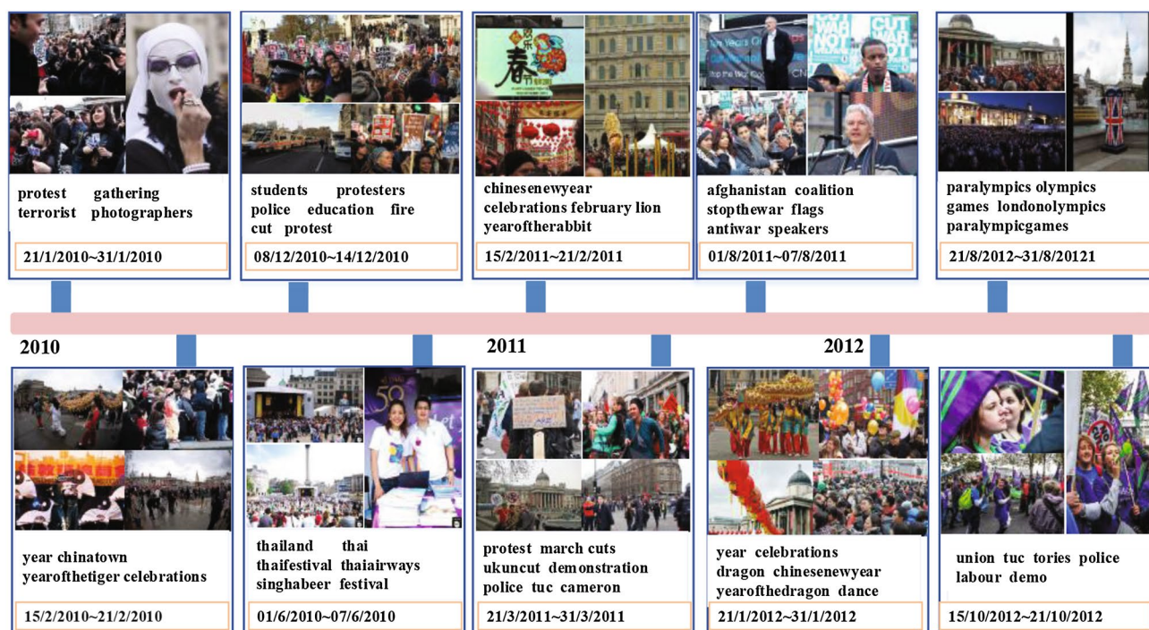
Fig. 3 The timeline of trafalgar square