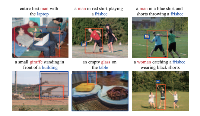
Figure 1: Examples of Referring Expression Grounding (REG). Given a query and an image, REG aims to localize the referential entity. We can observe that besides visual attributes, relationship with other entities is often used to describe the target entity. The target entity and its corresponding proposal are shown in red. The contextual entity and its corresponding proposal are shown in blue.

propose a variational Bayesian method to exploit the reciprocal relation between the referent and context for referring expression grounding. However, their method learns to model the relationship between referent and context based on the annotation of the target entity. Thus the model is not suitable under the weakly supervised setting, where neither the annotations for target nor that for context are available for training.