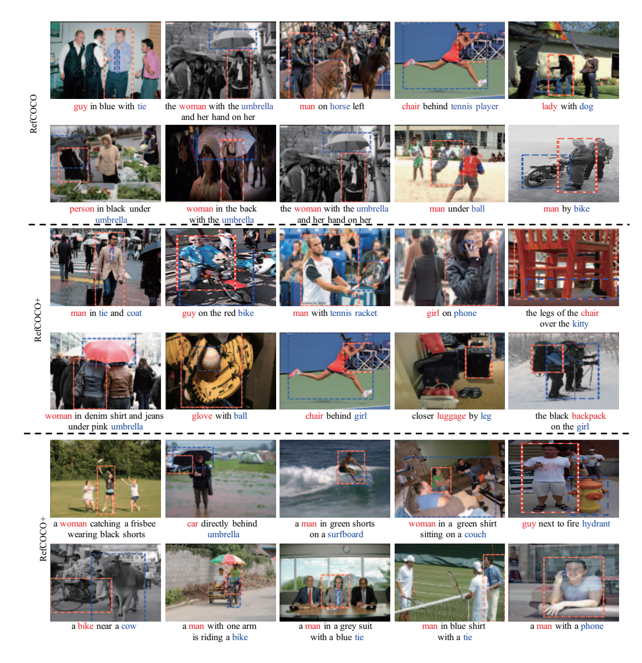
Figure 4: Qualitative results on RefCOCO, RefCOCO+ and RefCOCOg datasets. The denotations of the bounding box colors are as follows. Solid white: ground truth; dashed red: predicted subject proposal; dashed blue: predicted object proposal.

attention to construct the subject-object proposal pairs with the supervision of such knowledge. Further, Pairwise attention and a weighting scheme are used to learn the final matching score between proposal pairs and query. Finally, pairwise reconstruction measures the grounding performance under weakly supervised setting. Experiments demonstrate that the proposed method provides a significant improvement of performance on four datasets.