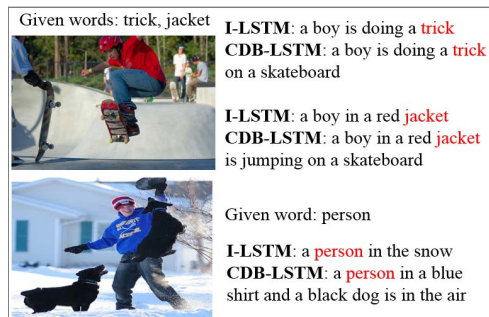
Fig. 3. Illustration of the superiority of the proposed CDB-LSTM over I-LSTM: the independent LSTM have two directions that blind to each other, and thus more likely to predict incoherent, inaccurate, or incomplete sentences.

It is not surprising that CDB-LSTM(GM) outperforms the others for it choose the ideal maximum value from multiple sentences driven by ground truth keywords. Randomly selecting one keyword from multiple candidates is more reasonable. One problem of our keyword-driven results is that these descriptions have different emphases for the same image, thus have a slight bias from the ground truth sentences which describe the main content of the image. Take the bottom image in Fig 1 for example, the sentences driven by the