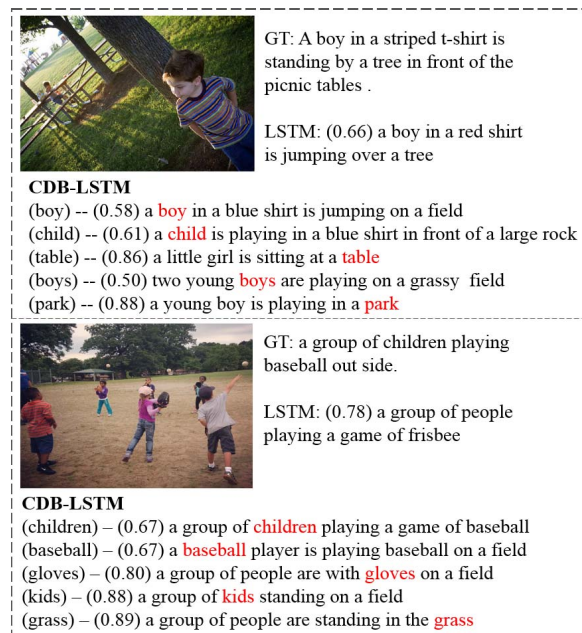
Fig. 1. Examples of our proposed method. The values shown in the brackets are the BLEU-1 scores.

Existing image captioning methods can be roughly categorized into two classes: the bottom-up and the top-down approaches. The bottom-up approaches [1, 2, 3, 4] that group keywords with connection words to form a sentence are popular in early research due to their simplicity. The top-down ones [5, 6, 7, 8] share a similar pipeline that first applies convolutional neural network (CNN) to extract visual features of the image, and then fed them to a sequential model, e.g., recurrent neural network (RNN), to generate descriptions of the